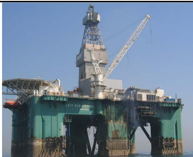
Figure 3 Semi-Submersible (Ocean Rig Leiv Eiriksson)