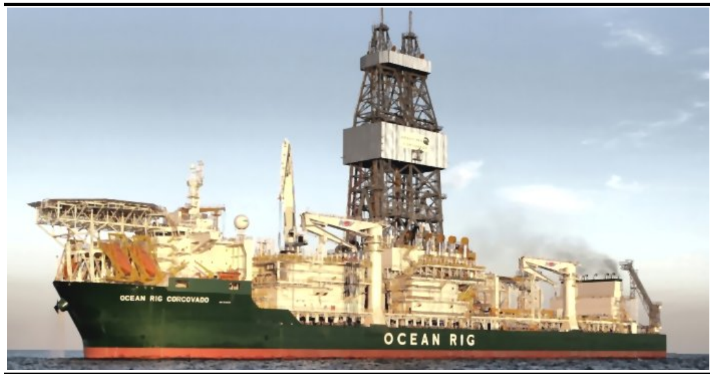
Figure 2 Drill Ship (Ocean Rig Corcovado)

A number of vessels will be employed to provide support and emergency cover for the operations, including supply boats, support vessels and ice management vessels. A 'wareship' will provide offshore storage and contingency accommodation, with helicopters and fixed wing aircraft used to transfer personnel to and from the field area, the support facilities and the international airport at Kangerlussuaq. It is planned to use onshore facilities at Nuuk and Aasiaat to support the drilling operations in the different offshore areas.